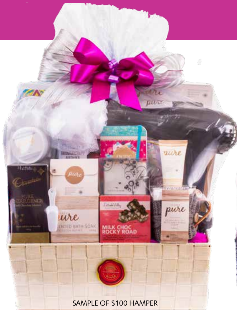
SAMPLE OF $100 HAMPER