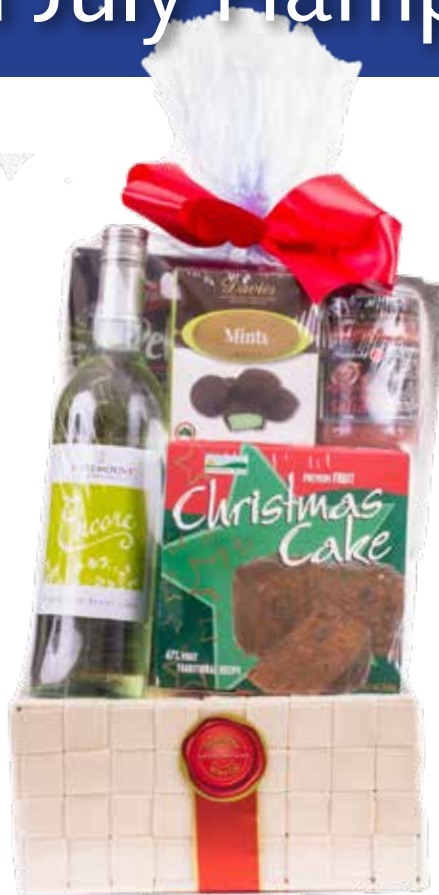
SAMPLE OF $75 HAMPER