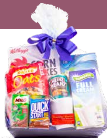
SAMPLES OF $35 HAMPERS