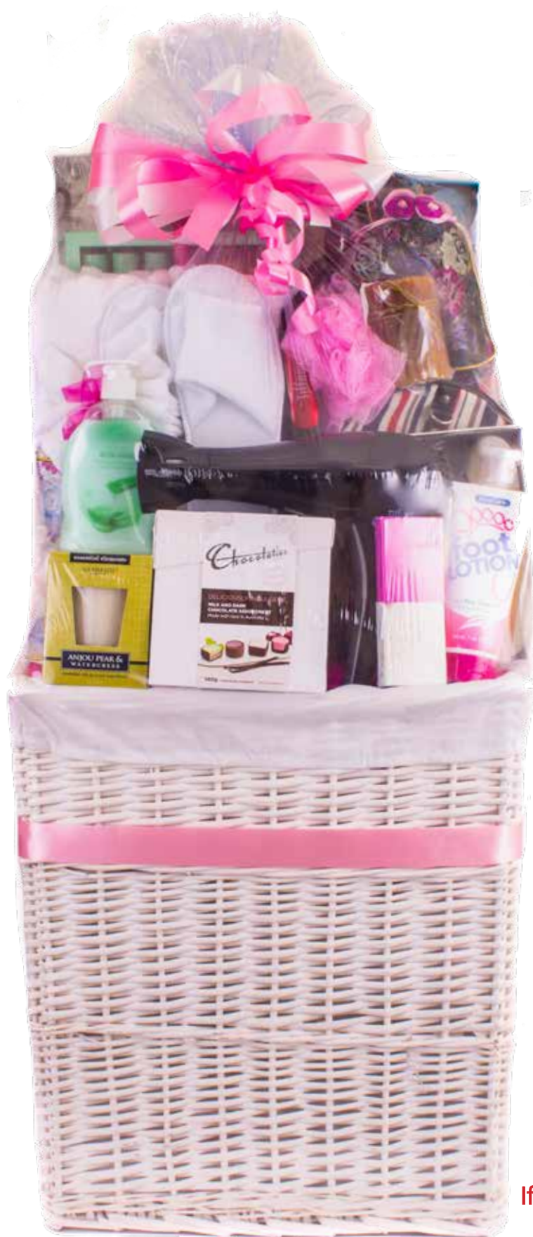
SAMPLE OF $225 HAMPER