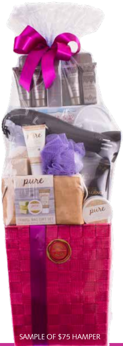
SAMPLE OF $75 HAMPER