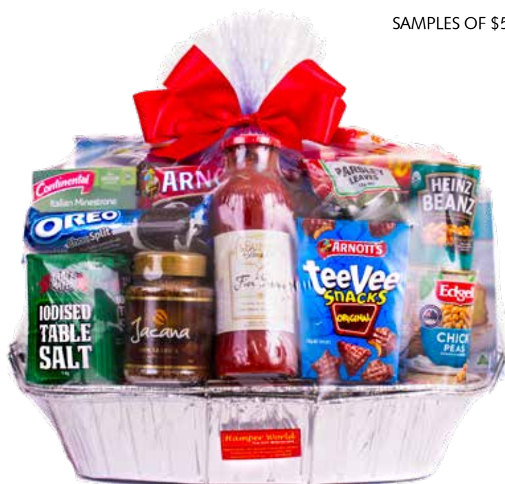
SAMPLE OF $75 HAMPER

Place your order online at www.hamperworld.com.au/hospitality or use the order form at the back of this book. Want to customise these trade promotions or design your own? Call us on 1800 566 433