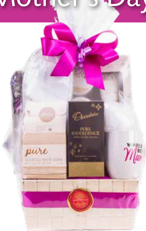
SAMPLE OF $50 HAMPER