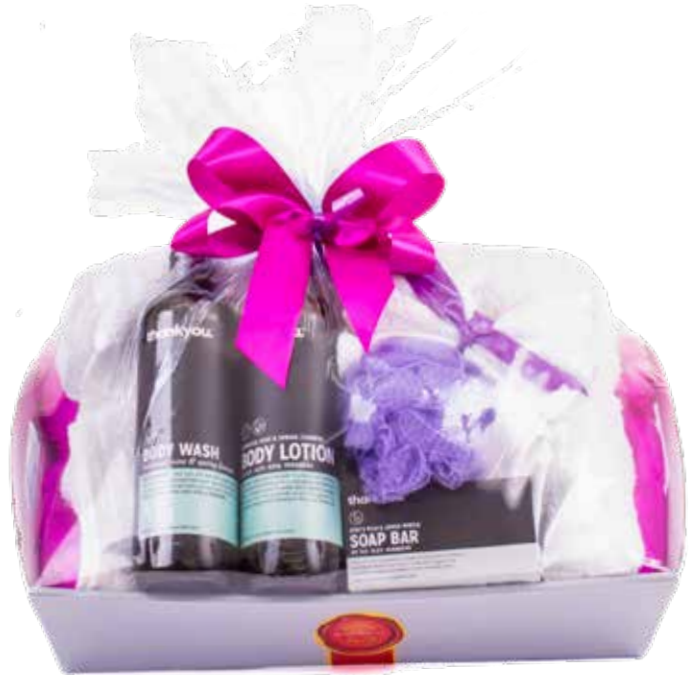
SAMPLE OF $50 HAMPER