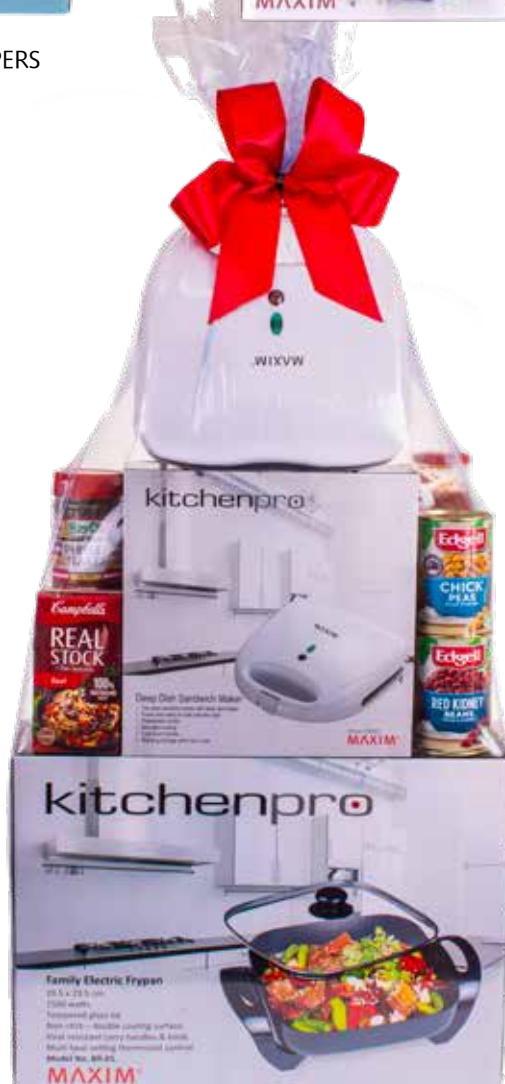
SAMPLE OF $100 HAMPER

Place your order online at www.hamperworld.com.au/hospitality or use the order form at the back of this book.