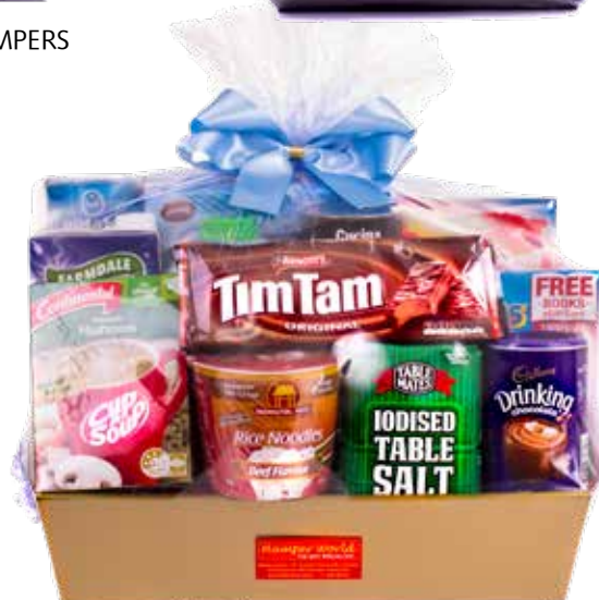
SAMPLES OF $50 HAMPERS