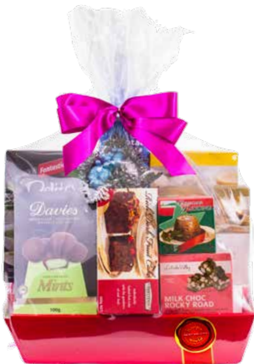
SAMPLE OF $50 HAMPER