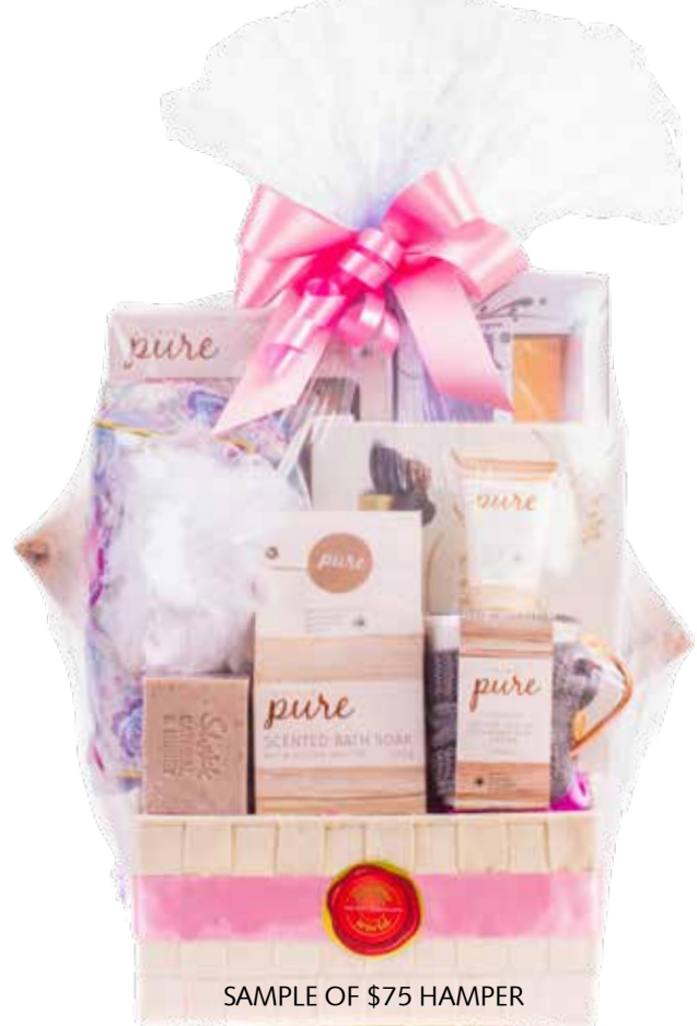
SAMPLE OF $75 HAMPER

Place your order online at www.hamperworld.com.au/hospitality or use the order form at the back of this book. Want to customise these promotions or design your own? Call us on 1800 566 433