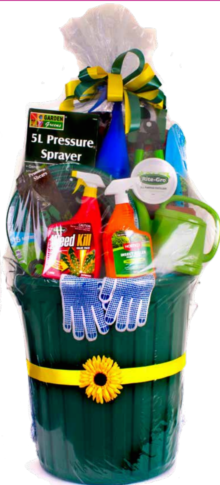
SAMPLE OF $150 HAMPER

If you would like to just order our gift packs and hampers simply call us on 1800 566 433 to place your order.