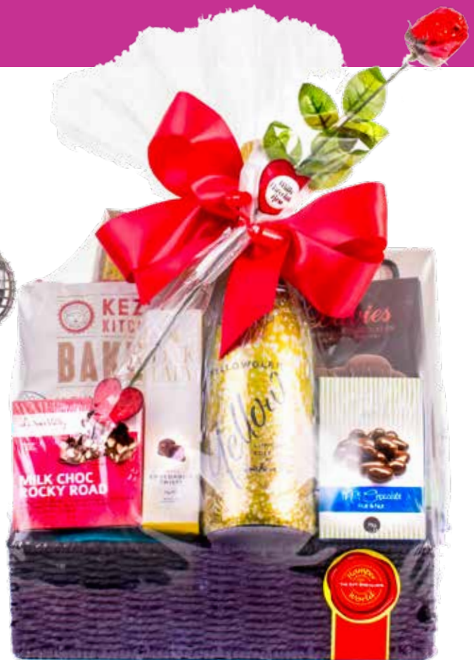
SAMPLE OF $75 HAMPER