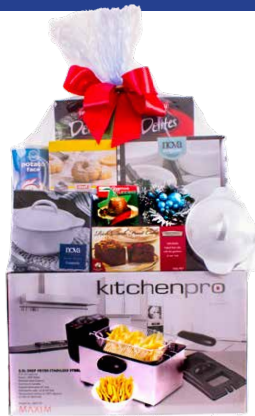
SAMPLE OF $100 HAMPER

Place your order online at www.hamperworld.com.au/hospitality or use the order form at the back of this book.