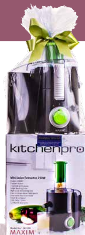
SAMPLES OF $50 HAMPERS