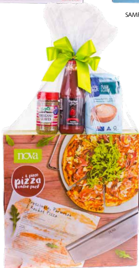
SAMPLE OF $75 PIZZA HAMPER